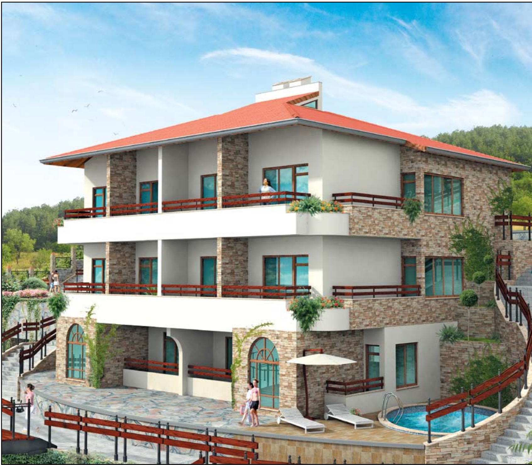
Block type 2