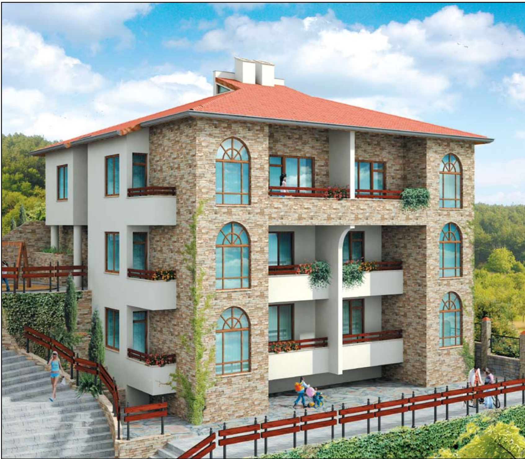
Block type 1