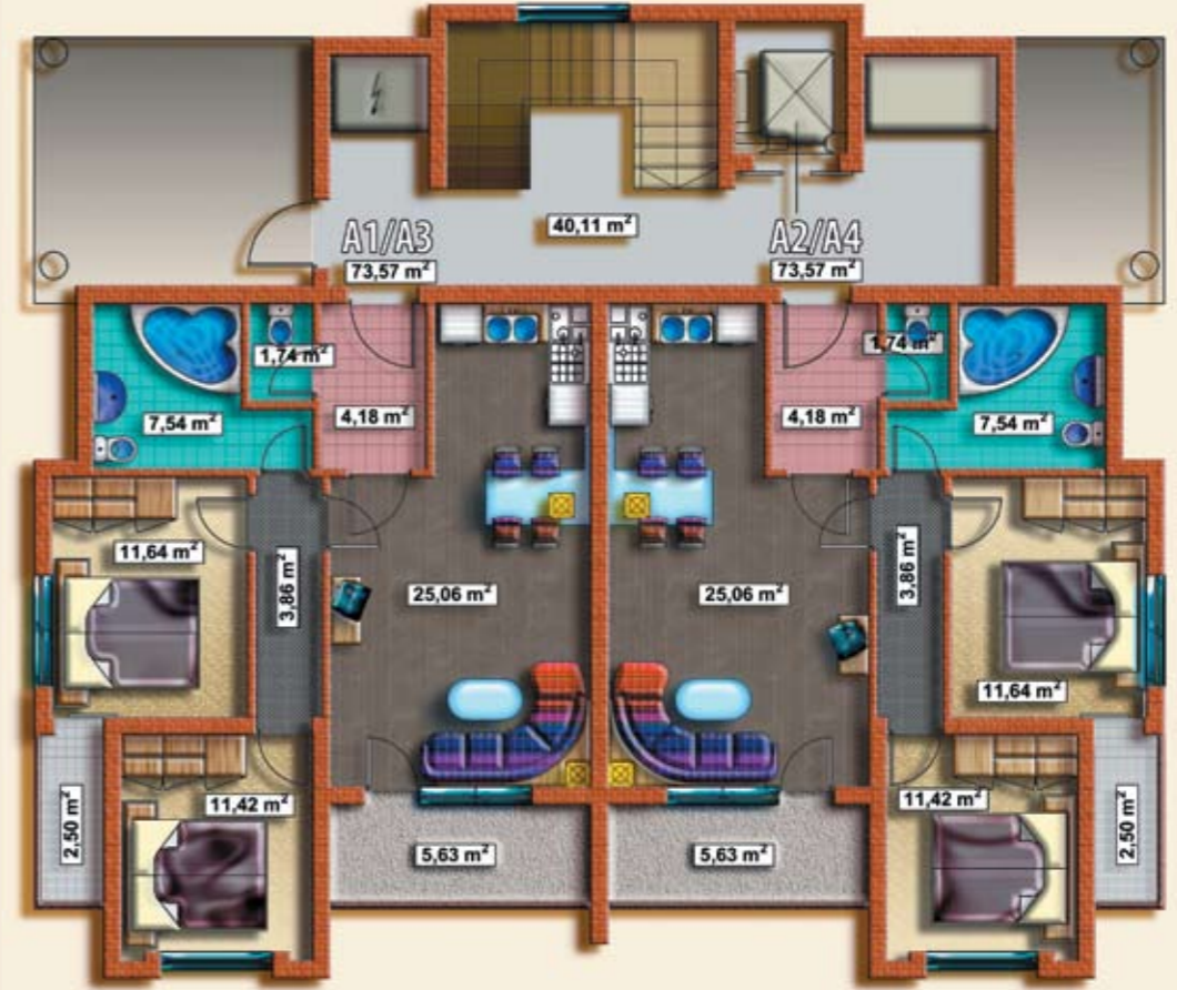
Ground and first floors