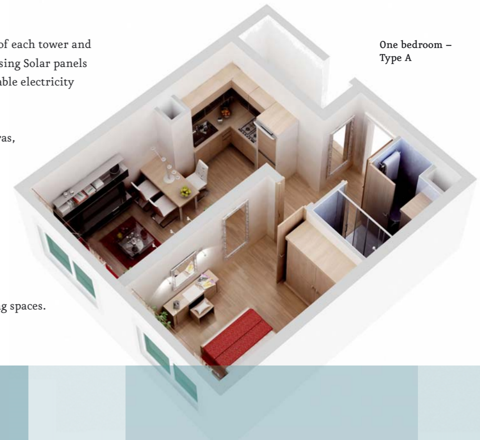
One bedroom – Type A

First class work and high quality material in the construction help to create safe living spaces.