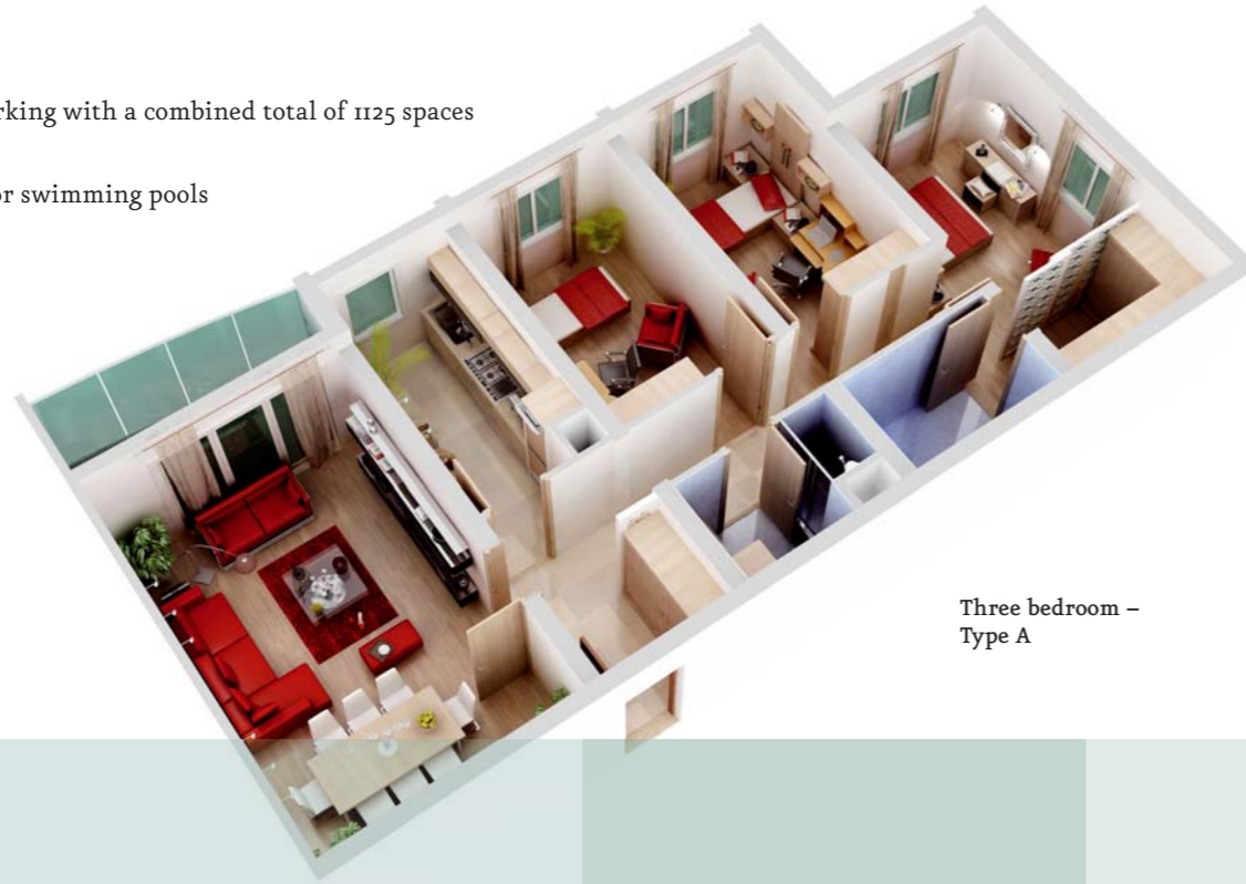
Three bedroom – Type A