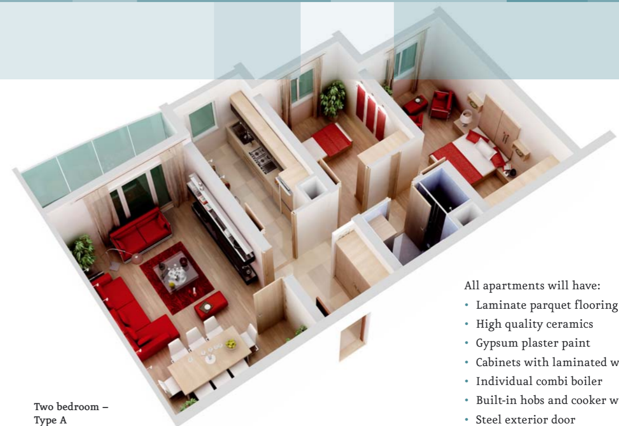
Two bedroom – Type A